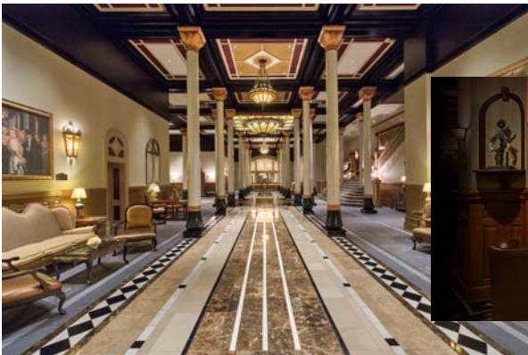
Experience The Driskill Bar, recently named the best cocktail bar of Austin by The Austin Chronicle !

Restored to its original opulence, The Driskill sets the standard for elegance in Austin, Texas. From the magnificent columned lobby with its marble floors and stained-glass dome to the classic, newly revitalized décor of the 189 guestrooms and suites, The Driskill ensures that every stay is a memorable one. As a member of The Historic Hotels of America, The Driskill is among the world's finest hotels, offering an unforgettable level of luxury and service.